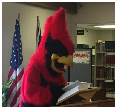
LCC Cardinal checking out the Library Open House