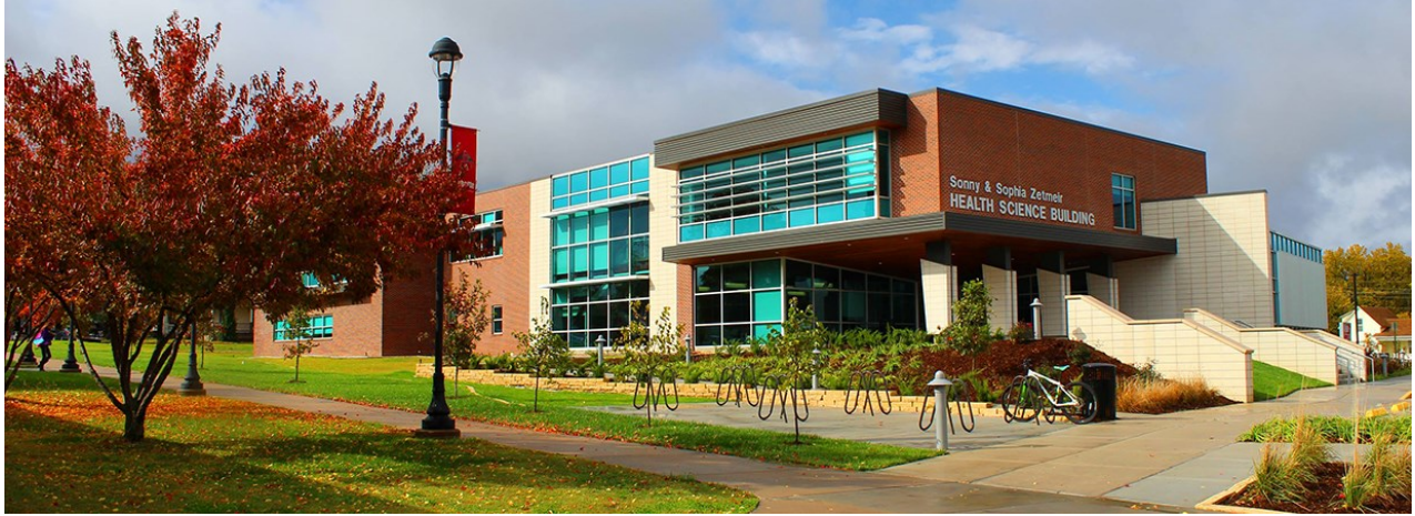
Zetmeir Health Science Building