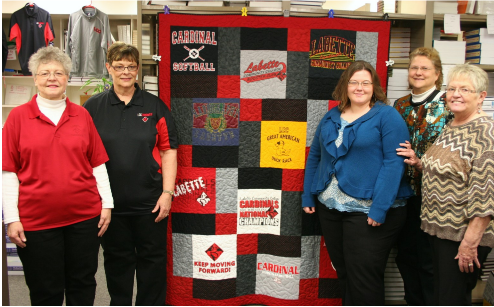
Above: T-shirt Quilt and Quilt Committee