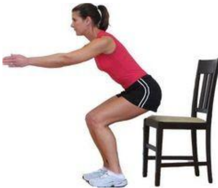
Chair sit or hover: make sure the chair is not on rollers.