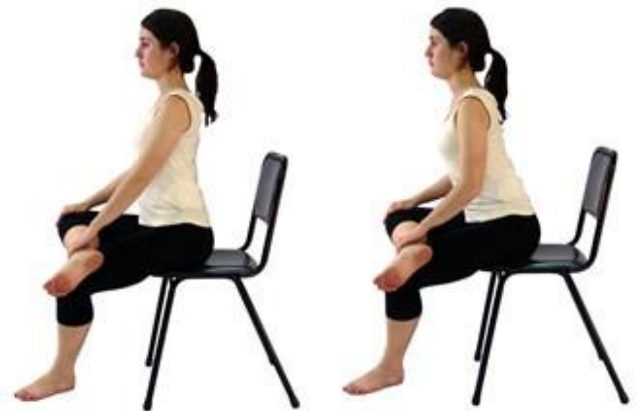
Piriformis stretch: hold 20-30 seconds 3-5 times