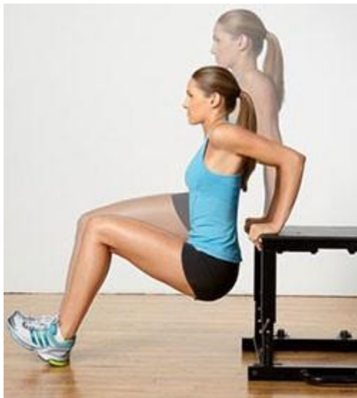
Chair dip: make sure that the chair is secure and will not roll away. Don't go past horizontal with your arms.