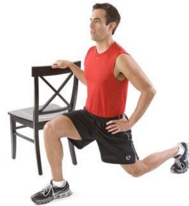
Lunges: Can use a chair for balance.